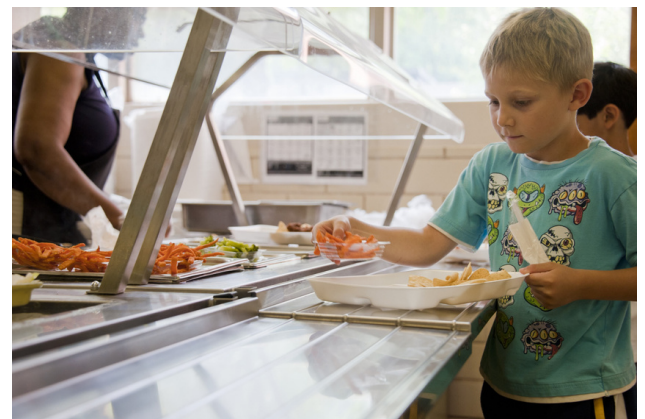
FareShare | Fighting hunger, tackling food waste in the UK